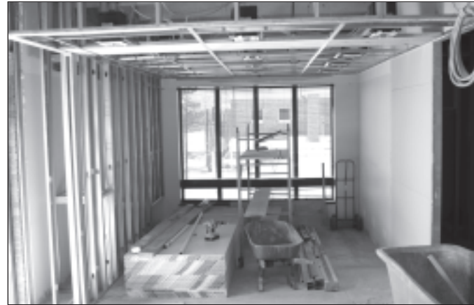
Site of our new business office to be finished in early March 2008.

Besides a fresher look, the Earlsboro business office will feature "The Broadband Room" with a 52" flat screen TV to showcase our Digital TV product. Our new 3Mbps High-speed Internet will be on display for