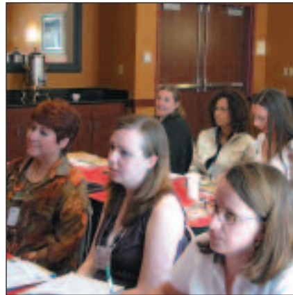
Teacher Institutes, sponsored by the Oklahoma Humanities Council, give K-12 educators the opportunity to increase confidence, professionalism, and subject knowledge on humanities-related themes.

Knowledgeable, enthusiastic teachers are a wise investment in Oklahoma's youth. Summer institutes sponsored by the Oklahoma Humanities Council (OHC) increase the confidence, professionalism, and subject knowledge of K-12 educators. Participants have the opportunity to network with peers and engage with distinguished university professors and other humanities professionals in an intensive exploration of curriculum-relevant topics. When teachers implement their innovative learning experiences in the classroom, students benefit for years to come. Watch the OHC website [www.okhumanitiescouncil.org/teacher-institutes] for details and registration information on this summer's institute offerings.